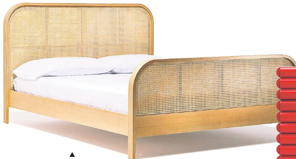
▲ Queen Cane Bed, $3,200, industrywest.com

A quiet cane-and-ash bed must room with a clamorous red-lacquered bureau. Design pros suggest pieces to bridge the aesthetic gap so the clashing pair can get a good night's sleep