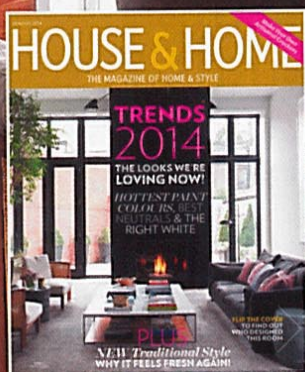
ON THE COVER: January 2014

"I like the strong focal point of the fireplace chimney breast. That and the striking black industrial windows emphasize the grandness of the height of the space. I love that there is a tree in there as well!"